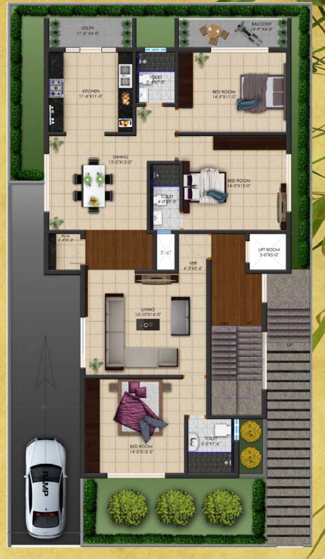
Ground Floor Plan - 1,880 sq.ft.