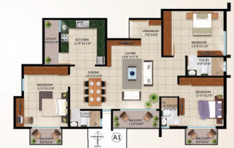
Typical 3 Bed Room Apartment