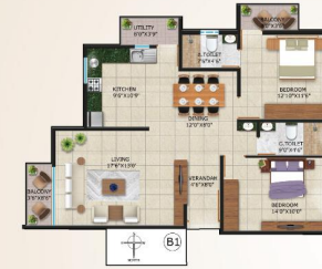
Typical 2 Bed Room Apartment